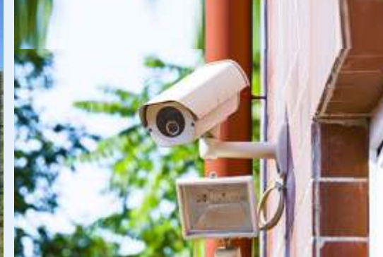
CCTV CAMERA SURVEILLANCE